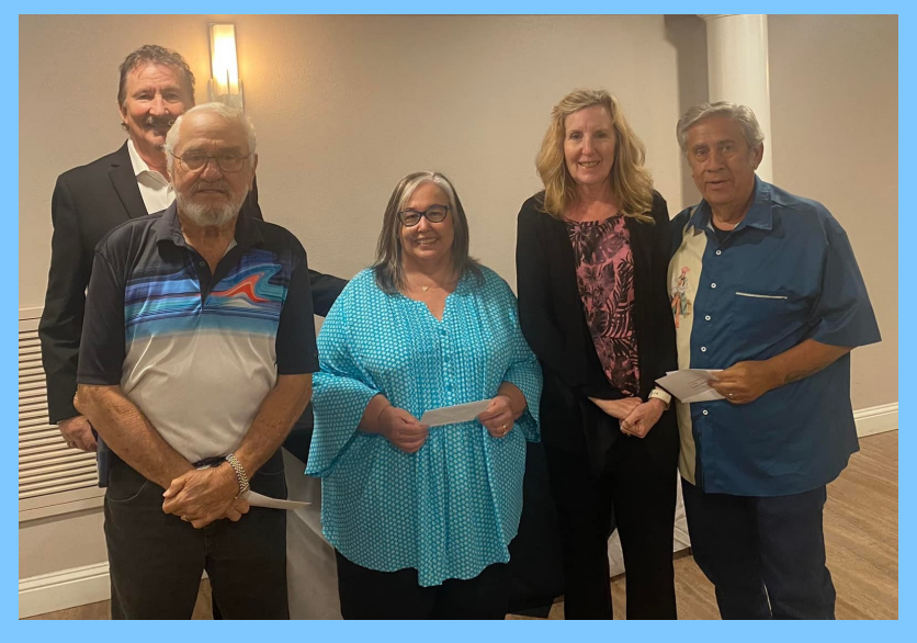
EXCELLENT ATTENDANCE AWARD RECIPIENTS