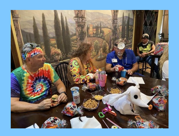
ORANGEFIELD HOMECOMING PARAGE OCTOBER 13, 2023