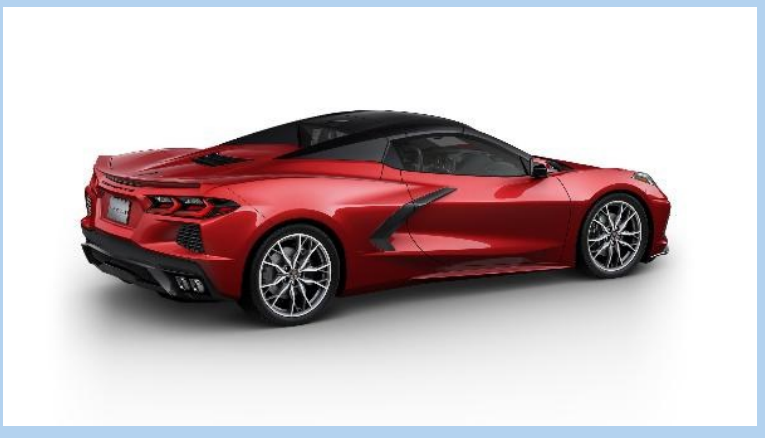
2024 Red Mist Corvette Convertible 4/27/2024